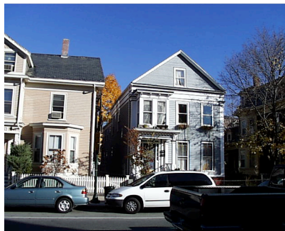
Click on Photo to view larger image.

Living Area: 2,699 Number of Units: 2 Total Rooms: 14 Bedrooms: 5 Kitchens: 2 Full Baths: 2 Half Baths: 0